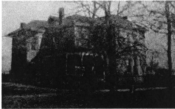
The Baillet House, photographed in the 1900s.

The Baillet House, which serves as part of the Tullahoma Fine Arts Center, is the oldest remaining building in Tullahoma. Part of the structure dates to the founding of the city in 1852.